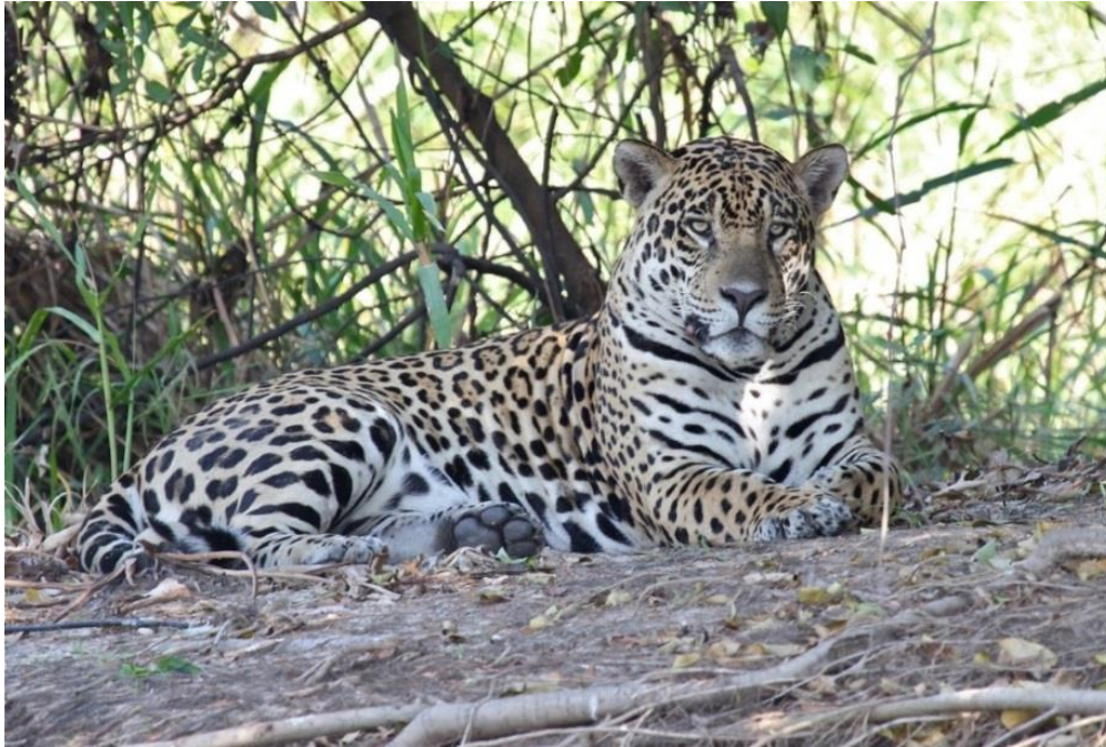
Jaguar (male), rio Tres Irmãos, Pantanal

anhingas, herons and kingfishers. The many sandbars along the rivers provide nesting and loafing sites for Black Skimmers, Large-billed and Yellow-billed terns, and Pied Lapwings (Plovers), while shaded riverbanks are prime places for spotting Bare-faced Curassows, Gray-cowled Wood-Rails and Sunbitterns. This area also boasts the highest concentration of Giant Otters that we have ever encountered, and the opportunities for viewing and photographing these amazing creatures are unparalleled. We also stand a chance of seeing Brazilian Tapir, the largest land mammal in South America. Combined with abundant Capybara and Caiman, three species of primates, and a non-stop parade of birds, our days here will be filled with adventure!