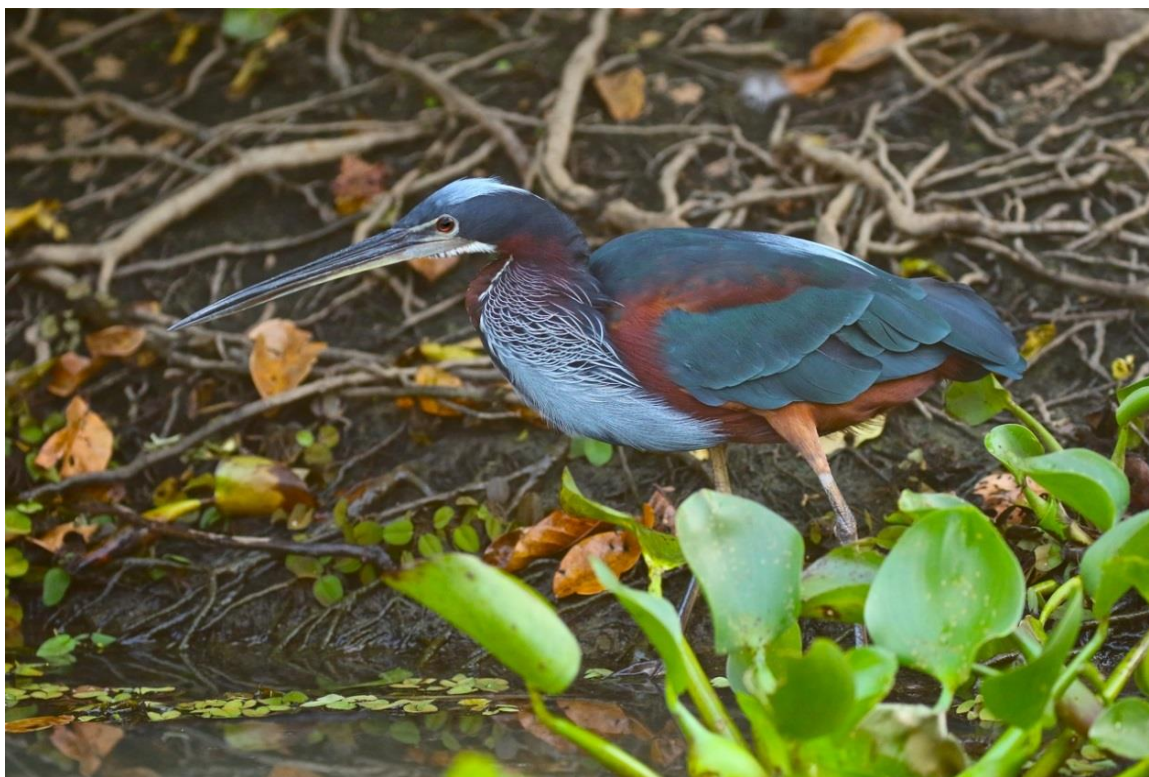
Agami Heron, rio Pixaim, SouthWild Pantanal lodge

August 11, Day 4: SouthWild Pantanal and the rio Pixaim. Dawn on Day 4 will bring an astonishing flurry of bird activity as we continue our Pantanal adventure. Just tearing ourselves away from the lodge feeders, which regularly host spectacular Toco Toucans, raucous Chaco Chachalacas and Purplish Jays, and mobs of smaller birds including flashy Yellow-billed Cardinals, will be a challenge. The gallery forest and brushy pastures along the rio Pixaim are alive with birds, among them Blue-crowned Trogon, Rufous-tailed Jacamar, Black-fronted Nunbird, White-wedged Piculet, Pale-crested and Golden-green woodpeckers, Red-billed Scythebill, Narrow-billed Woodcreeper, Pale-legged and Rufous horneros, White-lored and Rusty-backed spinetails, Great Antshrike, Band-tailed Antbird, Plain Antvireo, Helmeted Manakin, Stripe-necked Tody-Tyrant, Fuscous Flycatcher, Rufous Casiornis, Purplish Jay, Masked Gnatcatcher, Ashy-headed Greenlet, Silver-beaked Tanager, Orange-backed Troupial, Variable Oriole, Red-crested Finch and many others. Such is the diversity of birdlife here that we could easily have seen more than 100 species before breaking for lunch! Our exact schedule over the next few days will remain flexible, allowing us to exploit changing water levels and birding conditions to full advantage.