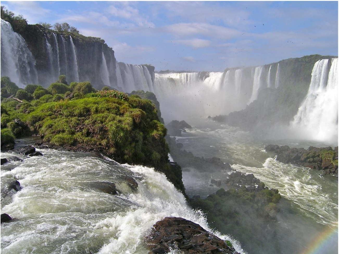
The Devil's Throat, Iguazu Falls NP, Brazil