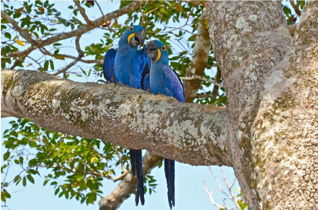
Hyacinth Macaws, rio Piquirí, Pantanal

year to year), and depending on water levels, it's here that we could be treated to flocks of waterfowl including Muscovy Duck, Brazilian Teal, and Black-bellied and/or White-faced whistling-ducks. Parrots are also well represented in the Pantanal, among them fast-flying groups of Yellow-chevrons Parakeets, screeching colonies of Monk Parakeets, Turquoise-fronted Parrots, and colorful Yellow-collared Macaws. However, one member of this family stands out above all others, the fabulous Hyacinth Macaw—biggest and most spectacular of its tribe and a near endemic of this region. These incredible blue-and-yellow birds will be one of the primary targets as we travel through the Pantanal. We'll also make one or more stops along the southern half of the Transpantaneira, to look for the stunning Scarlet-headed Blackbird, an uncommon and localized resident of marshes vegetated with a mixture of papyrus and Alligator Flag.