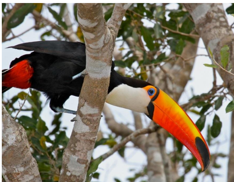
Toco Toucan, SouthWild Pantanal lodge

The Transpantaneira itself is a source of wonder. Developed in the 1970s as an ill-fated plan to connect the Brazilian interior with Bolivia via an overland route, the project ultimately halted in the wake of a funding shortage and insurmountable challenges attributable to geography and climate. Remarkably, the resulting road became a boon for wildlife viewing. Although a