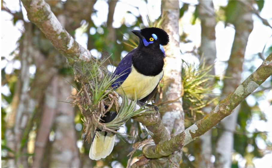
Plush-crested Jay, Iguazu Falls NP, Brazil

NIGHT (August 6): Hotel das Cataratas, Iguazu Falls