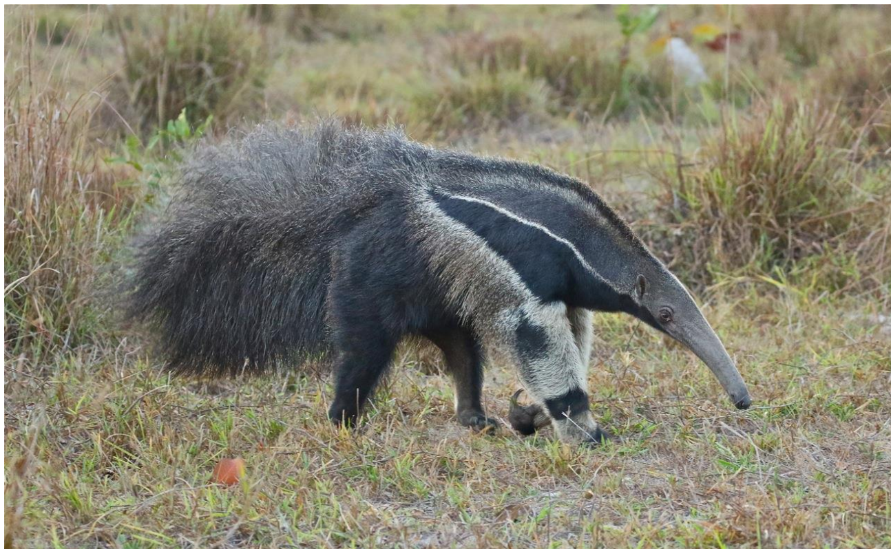
Giant Anteater, Pousada Piuval, Transpantaneira