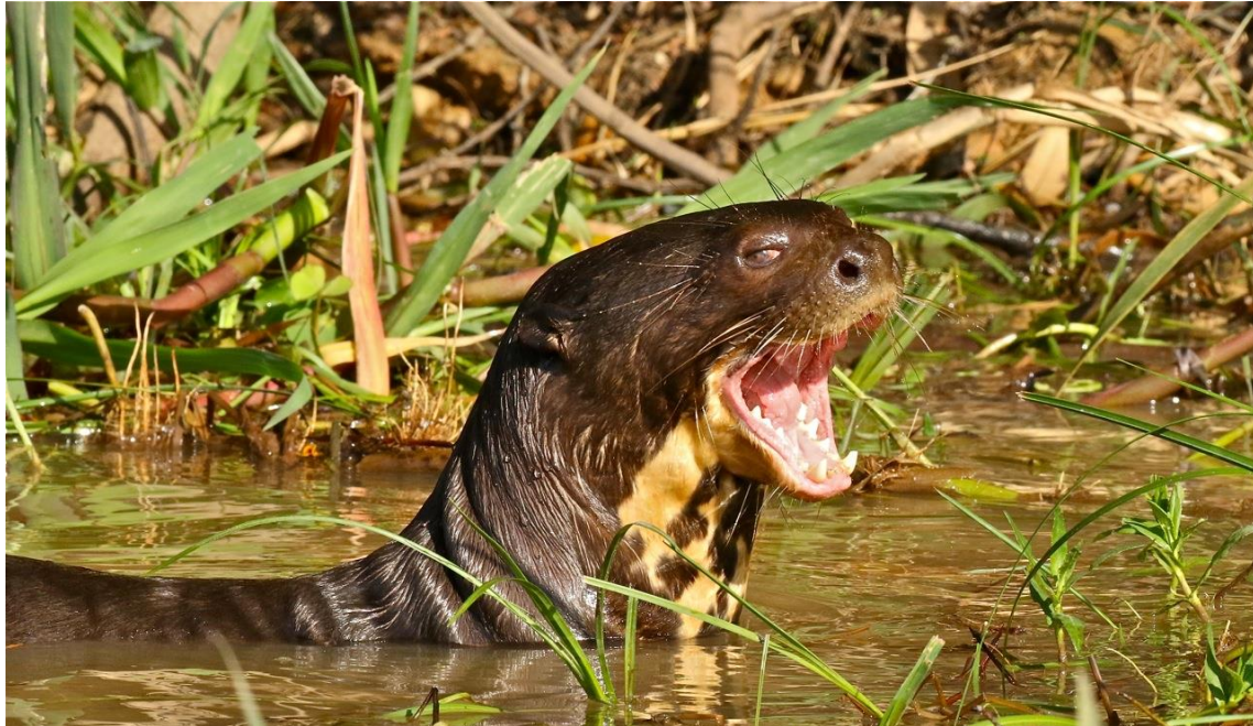
Giant Otter, Corixo Negro, Pantanal

NIGHTS: SouthWild Jaguar Suites, rio Piquirí (August 13-15) SouthWild Pantanal, Pixaim (August 16)