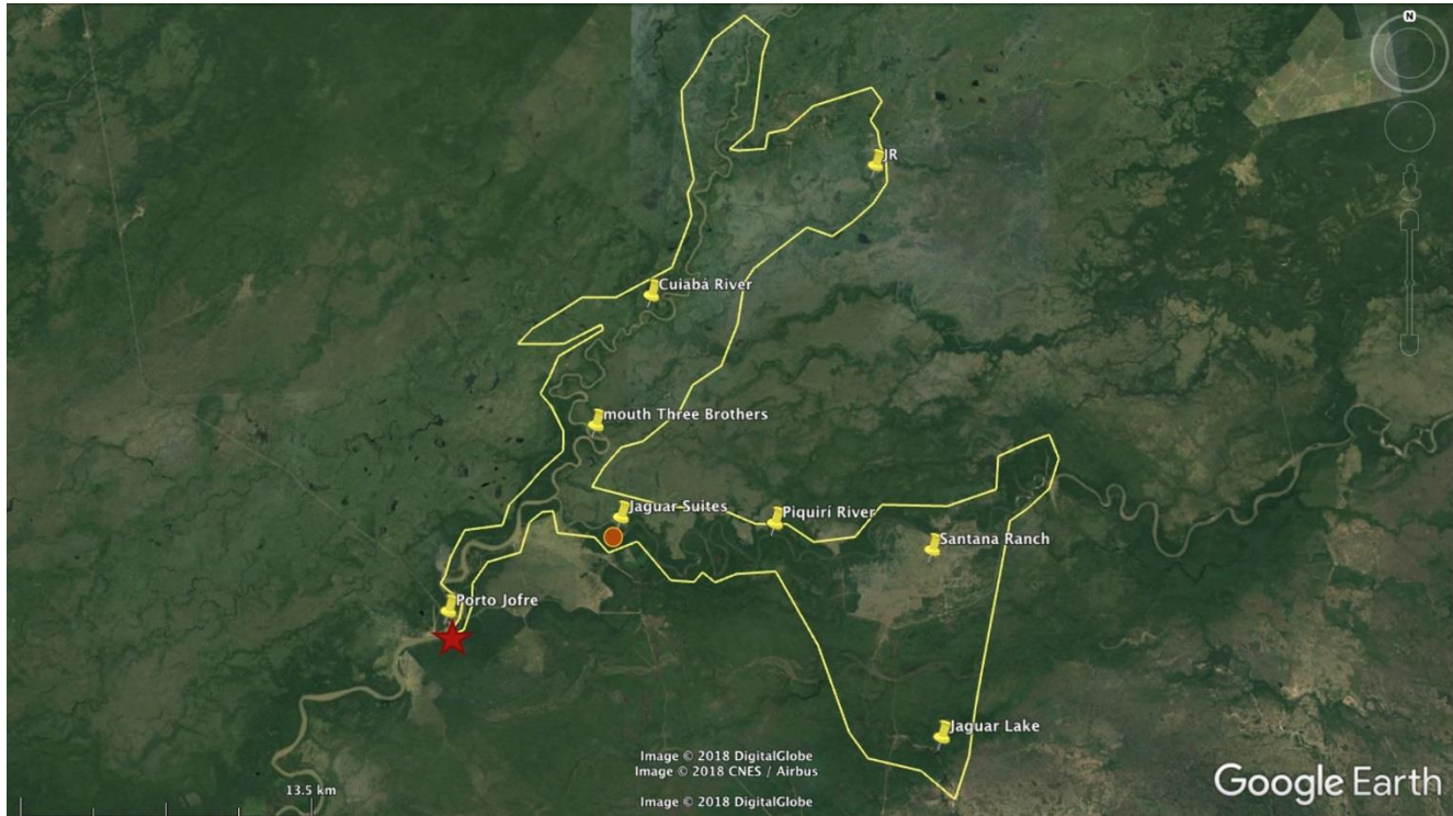
"Jaguar Land," map courtesy of SouthWild

offers good food and lots of ice-cold drinks (including some pretty spectacular caipirinhas! ). Once we have settled in to our cabins and have lunch, we'll set off on our first boat excursion in search of Jaguars.