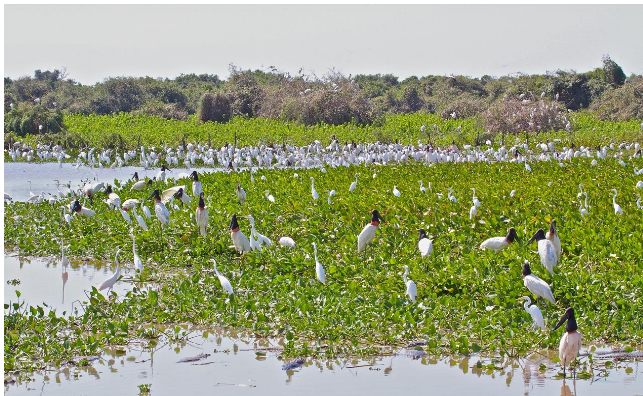
Jabirus and egrets, rio Bento Gomes, Transpantaneira

herons, ibis, storks, cormorants, raptors, and kingfishers will immediately recall Africa to those who have been there. Small birds are equally conspicuous, and daily lists of over 100 species are not unusual. Among the prizes we'll seek are Maguari Stork, Jabiru, Plumbeous Ibis, Southern Screamer, Chaco Chachalaca, White-throated (Gray's) Piping-Guan, Chestnut-bellied Guan, Bare-faced Curassow, Sunbittern, Sungrebe, the incomparable Hyacinth Macaw, Yellow-collared Macaw, Nanday Parakeet, Turquoise-fronted Parrot, Long-tailed Ground-Dove, Nacunda Nighthawk, Buff-bellied Hermit, Blue-crowned Trogon, Toco Toucan, Purplish Jay, Pale-crested and White woodpeckers, Great Rufous Woodcreeper, Red-billed Scythebill, Chotoy Spinetail, Gray-crested (Rufous) Cacholote, Mato Grosso Antbird, Large-billed Antwren, Black-backed Water-Tyrant, Helmeted Manakin, Fawn-breasted Wren, Green-backed Becard, Orange-backed Troupial, Variable Oriole, Scarlet-headed Blackbird, Yellow-billed Cardinal, Rusty-collared Seedeater and others. As an added bonus, our chances for seeing a Jaguar, the most spectacular predator in all of South America, are all but guaranteed. Each of our last 20+ visits here has resulted in amazing prolonged observations of one or more of these magnificent cats, and we have modified our itinerary in recent years to make our odds of success even more certain.