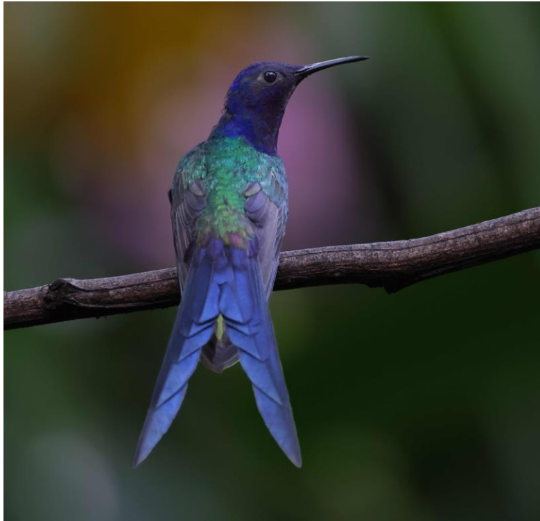
Swallow-tailed Hummingbird Eupetomena macroura

to the Argentina side turns out to be impossible for reasons beyond our control, we will pay a second visit to the Pozo Preto road, in the rainforest patch on the Brazilian side.